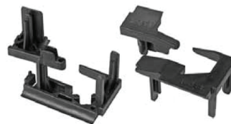
End Cap Kit

See FFI Catalog section C for details, at www.Fenestration.net . Contact FFI for details & ordering info: 800-677-0228 or service@fenestration.net