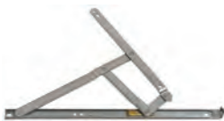
stainless steel hinges page I-12