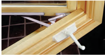
dual-arm operators page I-2