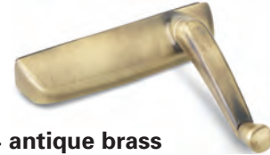
14 antique brass