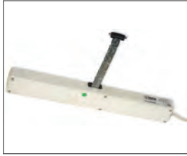
Truth Marvel motor