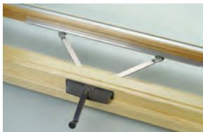
Awning operators page I-5

A casement window is hinged on the side, and swings open like a door.