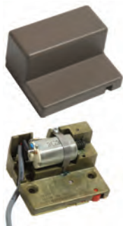
16.49.03.100 motorized window lock