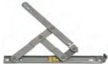
34.10.00.101 with stop