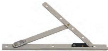
13.13.00.014 LH E-Gard

Some parts are specified as: LH = left-handed or RH = right-handed. Truth handing is determined by which side the hinge is on when viewed from the OUTSIDE