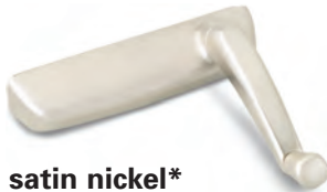
10 satin nickel*