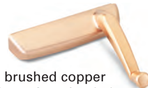
46 brushed copper (discontinued 06/10)