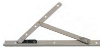
13.13.00.015 RH E-Gard