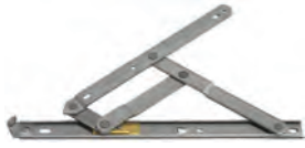
34.25.00.111 with stop