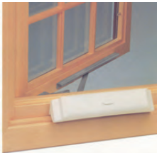
Sentry II motors page I-18