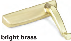
13 bright brass