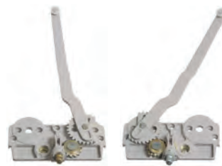
15.94 LH 15.94 RH

*Items Discontinued by Truth: FFI has some items on hand, until stock is gone.