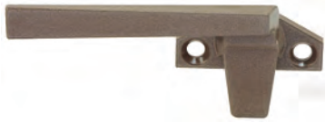
25.29.03.102 cam handle - offset, 03 = bronze