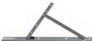
14.97.00.506 UL stainless