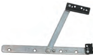
14.96.00.180 LL CoastGard