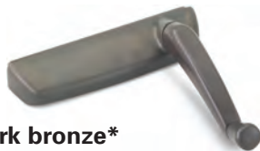
52 dark bronze*