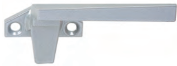
25.29.01.103 cam handle - offset, 01 = aluminum