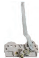
15.24.00.001 stainless steel