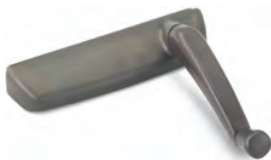
handles and covers sold separately see page I-6