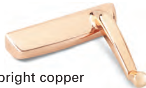
45 bright copper (discontinued 06/10)