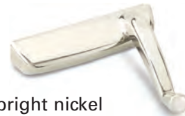
54 bright nickel (discontinued 06/10)