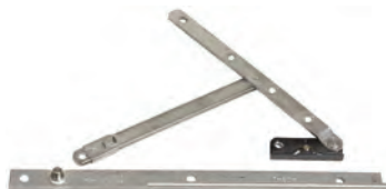
13.43.00.102 arm, LH SST 13.43.00.202 track, LH SST