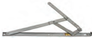
34.61.00.100, 90 deg. stop