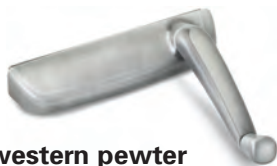
55 western pewter