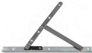
14.80.00.504 UL stainless