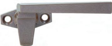
25.31.03.103 cam handle - in-line, 03 = bronze