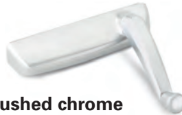
53 brushed chrome