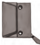
23 chestnut bronze - dark brown