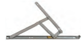
34.56.00.100, 90 deg. stop