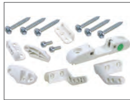
accessories included with Truth Marvel

1 year Truth motor warranty requires installation by a licensed electrician.