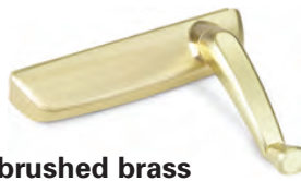
58 brushed brass

*In 2010, Truth discontinued finish #51 oil-rubbed bronze (ORB) and #19 brushed nickel. FFI has some items on-hand, available until stock is gone. Truth replacements for #51 are #52 clear-coated dark bronze and #FB faux oil-rubbed bronze. Truth replacement for #19 is #10 satin nickel.