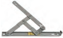
34.24.00.103 no stop