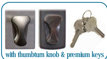
with thumbturn knob & premium keys