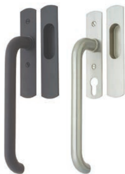
LS100 Classic brass handles