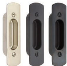
short pull - face mount