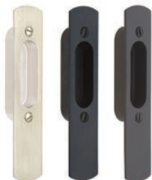
long pull - face mount