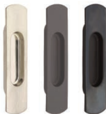
shallow short pull - rear mount