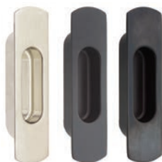
short pull - rear mount