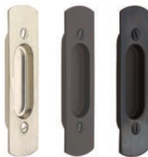
shallow short pull - face mount