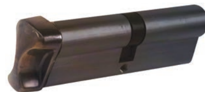
FFI cylinders — in brass with choice of finishes