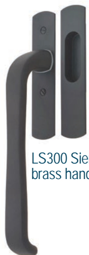
LS300 Sierra brass handles