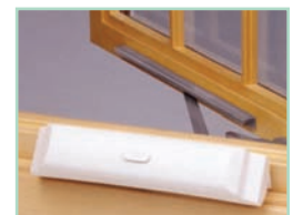
Truth WLS In Stock $349.95

It's hard not to notice the growing opportunities in Green building and LEED certified projects being mandated in more cities every day. FFI's line of motors for windows and skylights facilitate goals for natural light, ventilation and energy savings; learn more at http://www.fenestration.net/green.html . With many motor projects for municipalities, universities and homes under our belt, FFI is ready to help with your projects.