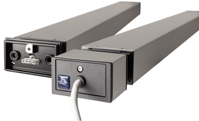
Interconnectors fit within actuator end cap. Can be plugged into either side of the actuator.

Discuss with AFI Sales & Support for your specific project/profile.