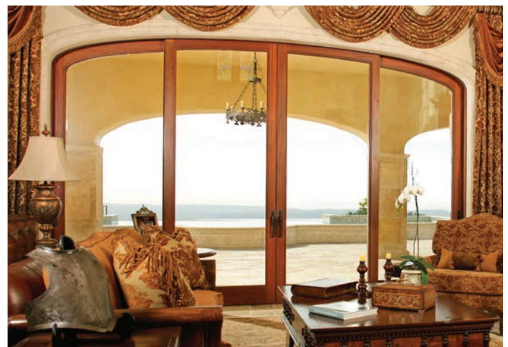
Sliding Specialties www.slidingspecialties.com