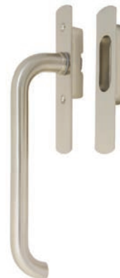
LS100 Classic Satin Nickel Handle Set