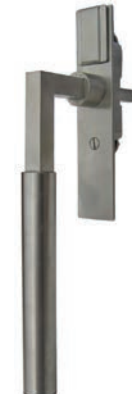
LS200 Ottawa Stainless Steel (Removable)