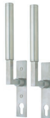
LS200 Ottawa Double Handle Set