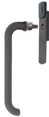
LS100 Classic ORB Finish (Removable)

Go to Fenestration.net for full door handles & pull offering.