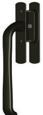
LS300 Sierra Painted Finish Handle Set