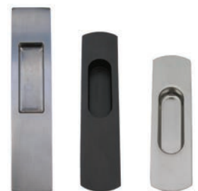
Flush Pulls Matching pulls for screens