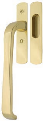
LS300 Sierra Polished Brass Handle Set