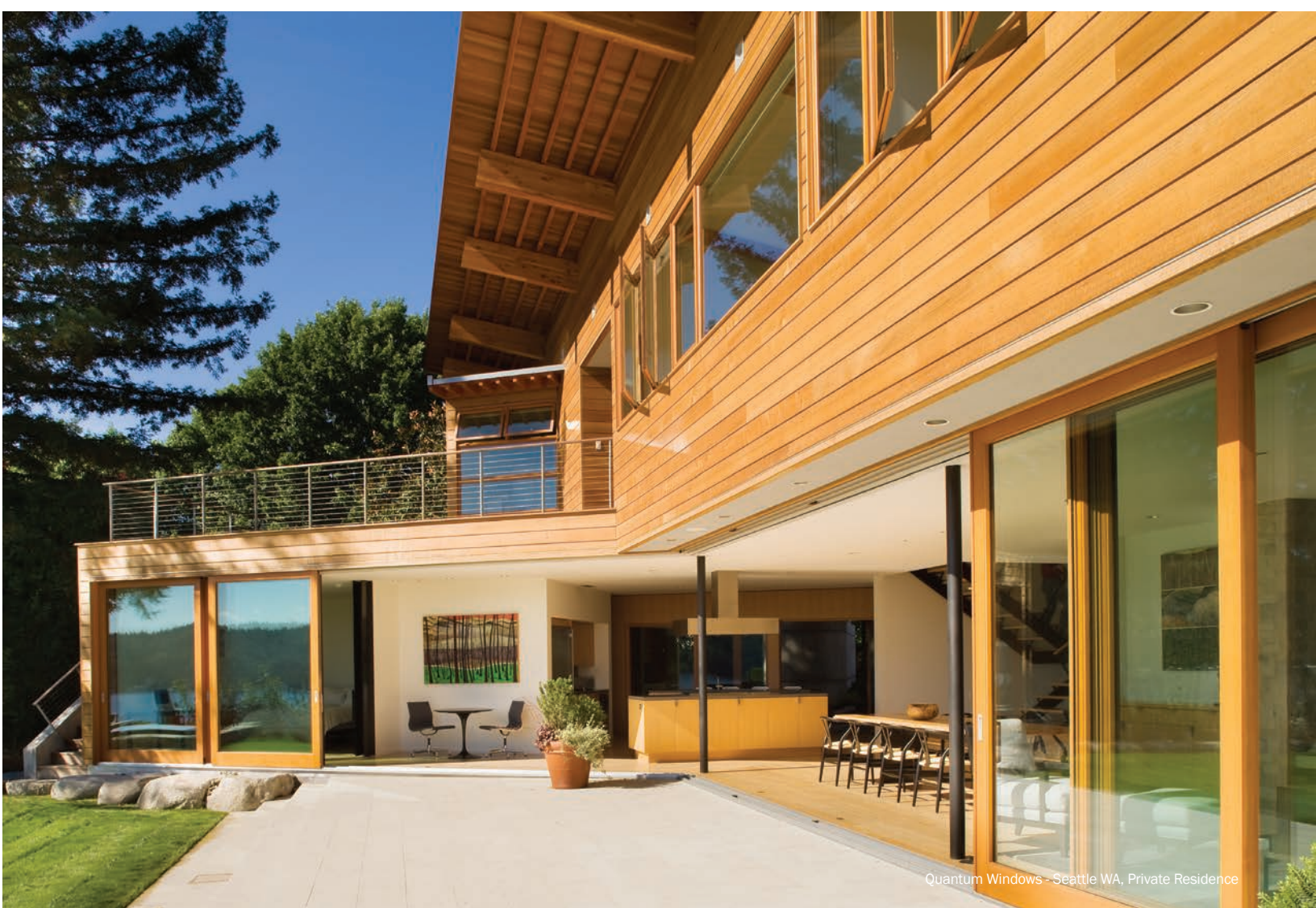
Quantum Windows - Seattle WA, Private Residence