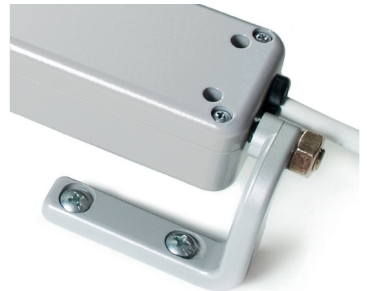
Mounting brackets available separately