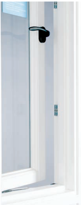
stainless steel lock face

See reverse side for part numbers and more details.