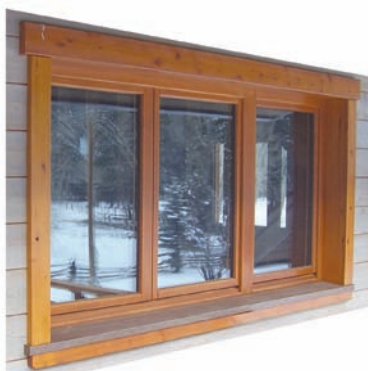
tilt turn windows by Cascade Woodwork, CO www.cascadewoodwork.com

Functional Fenestration Inc (FFI) has European Tilt Turn multipoint window systems designed to meet architectural needs for large openings, and to help meet performance requirements for secure alignment, warp-prevention and hurricane testing. Tilt Turn provides 2 functions in one window: hopper and casement.