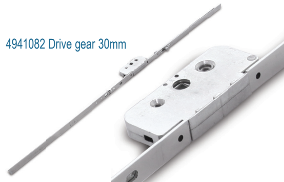
4941082 Drive gear 30mm

(See FFI Winkhaus easyPilot Nordic catalog for details and other options)