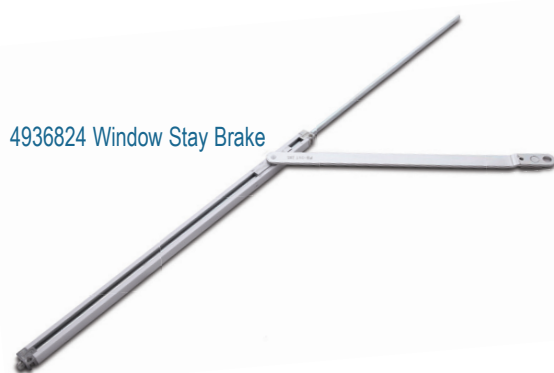
4936824 Window Stay Brake