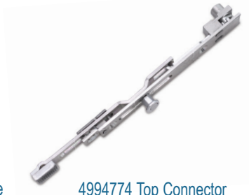
4994774 Top Connector