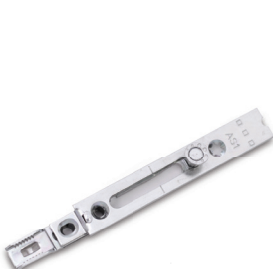
4937603 Bottom Terminal