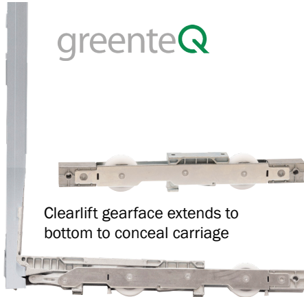
Clearlift gearface extends to bottom to conceal carriage